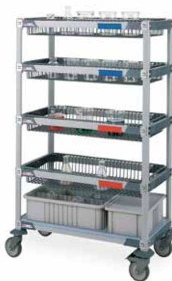
MetroMax i® 4 Basket Glassware Cart (Shown with casters and accessories)

*MICROBAN is a registered trademark of Microban Products Company.