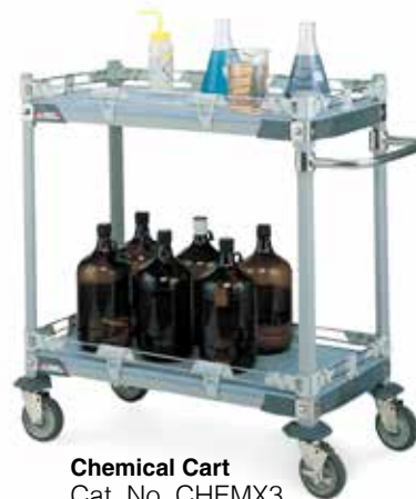
Chemical Cart Cat. No. CHEMX3 (Casters included)