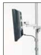
FMAX and TMX

Dimensions: 2 1/4"W.x13"L.x4 1/4"H. (57x330x108mm)