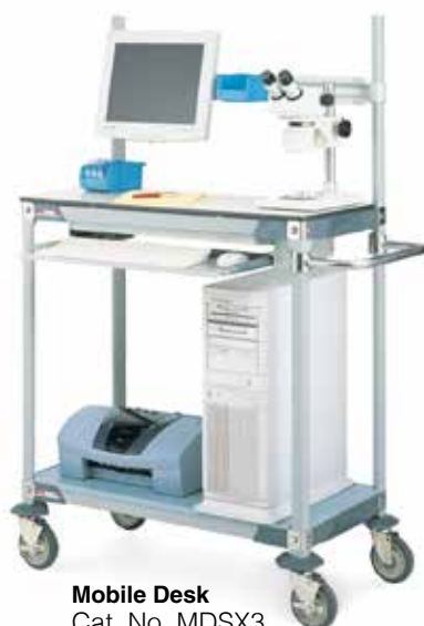
Mobile Desk Cat. No. MDSX3 (Casters included)

Metro's Lab Cart line includes a General Lab Cart, Chemical Cart, and Mobile Desk. All carts are designed to offer superior corrosion resistance. Smooth rolling, 5" (127mm) polyurethane casters come standard with each cart. All shelves adjust in 1" (25mm) increments, offering precise shelf adjustment and maximum storage utilization.