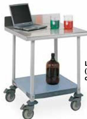
LTM30XS3 (Shown with casters)