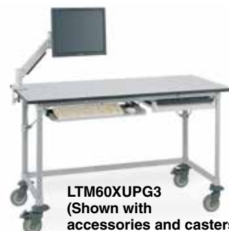
LTM60XUPG3 (Shown with accessories and casters)

Note: Lab Worktables are load rated at 50 lbs. (23kg) per square foot up to a maximum of 600 lbs. (273kg), assuming load evenly distributed. Worktables with Black Phenolic Top and 3-Sided Frame