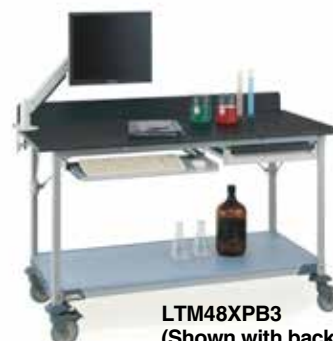
LTM48XPB3 (Shown with backslash accessory and casters)

Note: Lab Worktables are load rated at 50 lbs. (23kg) per square foot up to a maximum of 600 lbs. (273kg), assuming load evenly distributed.