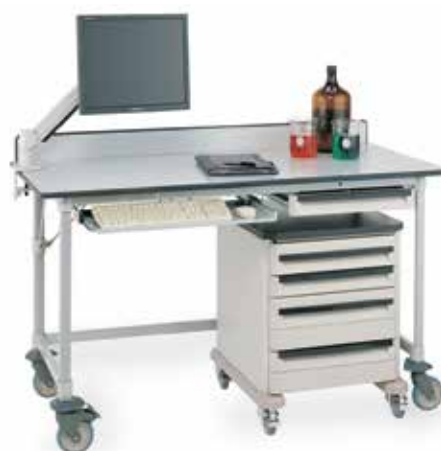
MetroMax i® Lab Worktable (Shown with accessories, casters and Starsys Cart)