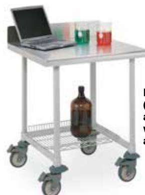
LTM30XUS3 (Shown with accessory wire shelf and casters)