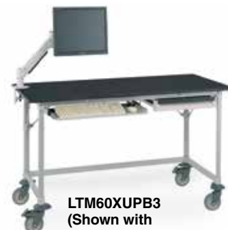
LTM60XUPB3 (Shown with accessories and casters)

Note: Lab Worktables are load rated at 50 lbs. (23kg) per square foot up to a maximum of 600 lbs. (273kg), assuming load evenly distributed. Worktables with Black Phenolic Top and 3-Sided Frame