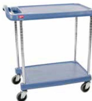
2-Shelf myCart ™

Metro polymer utility carts with Microban ® antimicrobial product protection are the most advanced general purpose carts in the marketplace today. Both the Deep Ledge and myCart ™ series offer models with built-in Microban ® antimicrobial product protection that inhibits the growth of bacteria, mold, mildew, and fungi that cause odors, stains, and product degradation.