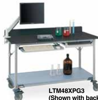
LTM48XPG3 (Shown with backslash accessories and casters)

Note: Lab Worktables are load rated at 50 lbs. (23kg) per square foot up to a maximum of 600 lbs. (273kg), assuming load evenly distributed. Worktables with Black Phenolic Top and 3-Sided Frame