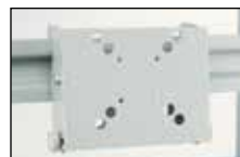
Cat. Nos. FM30X3/ FM36X3/FM48X3 (Cross Bar and Mounting Bracket included)