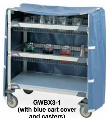
GWBX3-1 (with blue cart cover and casters)

*Each Metro tote kit includes TB93060NAT (1), TB92060NAT (1), DL93060NAT (3), DS93060NAT (3), DS92060NAT (3), and DL92060NAT (3).