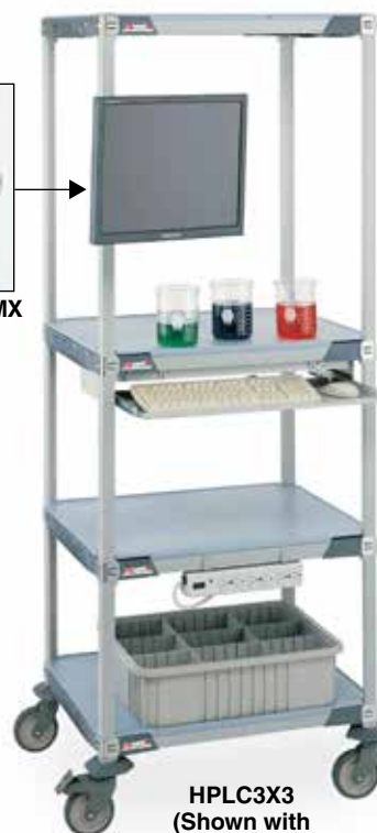
HPLC3X3 (Shown with accessories and casters)