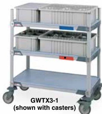
GWTX3-1 (shown with casters)