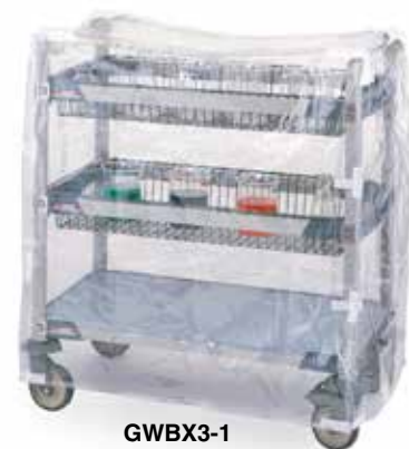
GWBX3-1 (with clear cart cover and casters)