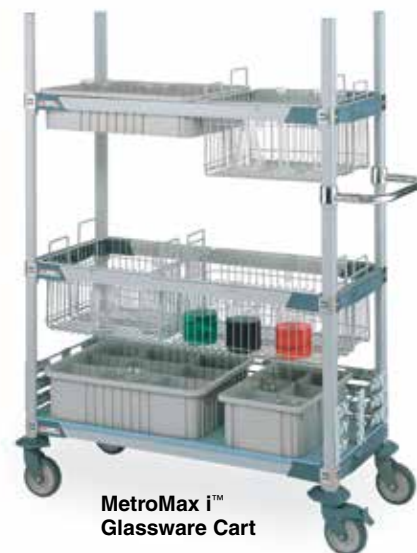
MetroMax i™ Glassware Cart