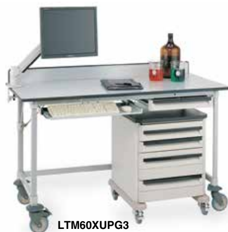
LTM60XUPG3 (Shown with accessories, casters and Starsys Cart)

Note: Lab Worktables are load rated at 50 lbs. (23kg) per square foot up to a maximum of 600 lbs. (273kg), assuming load evenly distributed.