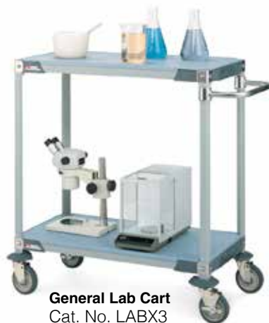
General Lab Cart Cat. No. LABX3 (Casters included)