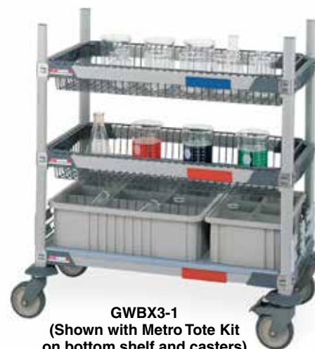
GWBX3-1 (Shown with Metro Tote Kit on bottom shelf and casters)