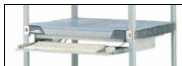
Cat. No. KBX