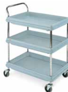
3-Shelf Deep Ledge Utility Cart