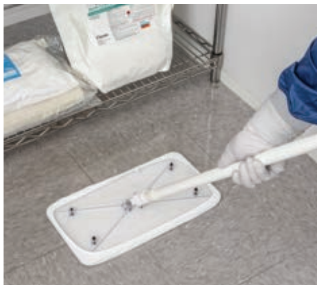
AlphaMop™ 100% Polyester Cover and Pad